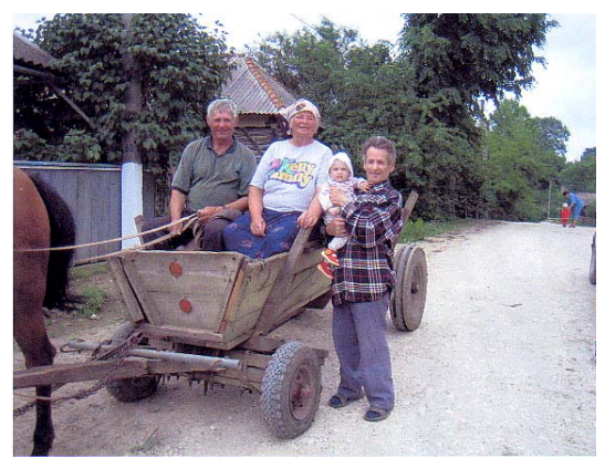
Pshybluv citizens welcome us

Back in the town, it seemed like everyone had come into the street to see what was happening. They came on foot or by horse and buggy, and the women all wore babushkas on their heads.